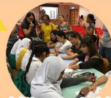
Racial Harmony Activities