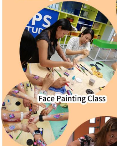
Face Painting Class