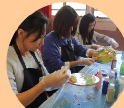
Fluid Painting Class