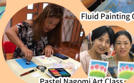
Pastel Nagomi Art Class